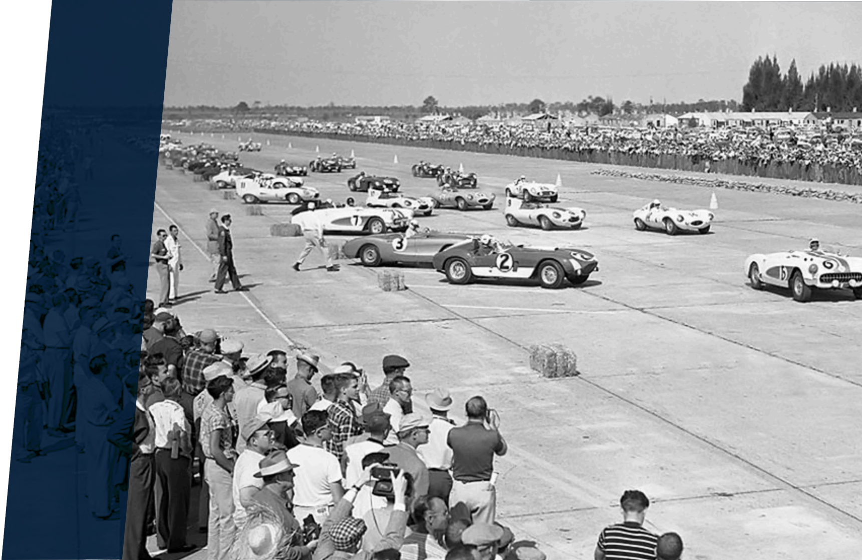
Right: Start of the 1956 Sebring 12 Hours