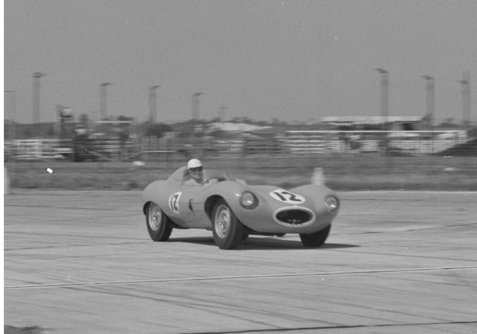
Right: XKD 545 at speed during the 1956 Sebring 12 Hours

Two weeks later Constantine entered the car for the 1956 Watkins Glen Sports Car Grand Prix. This was to be a significant race being held on the newly redeveloped circuit. However construction delays meant the surface was only finished the day before, and a dispute between the SCCA and circuit management, caused the SCCA recommending to its members that they boycott the race due to the surface breaking up after qualifying (in which Constantine took pole in the main race). However a show of hands during the drivers' briefing showed all present wished to go ahead. Constantine romped away from the opposition to take victory having lapped all but 4 of the other drivers.